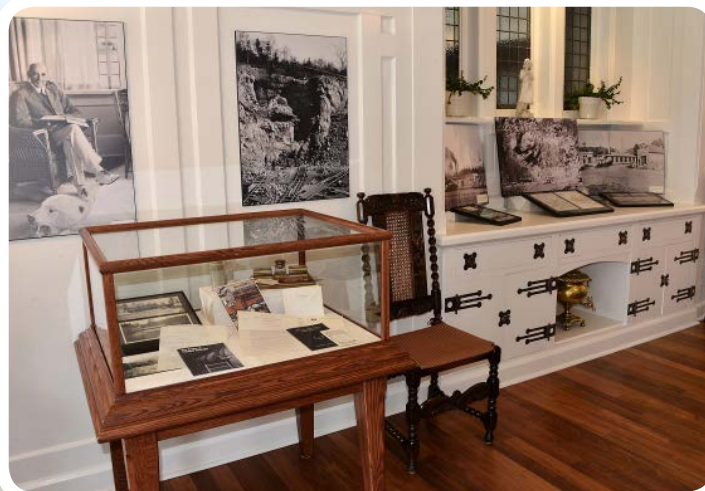
Our Historical Display, detailing the story of The Gardens through photographs, memorabilia and letters is exhibited through several rooms of the Butcharts' former residence. (Closes March 15 th .)