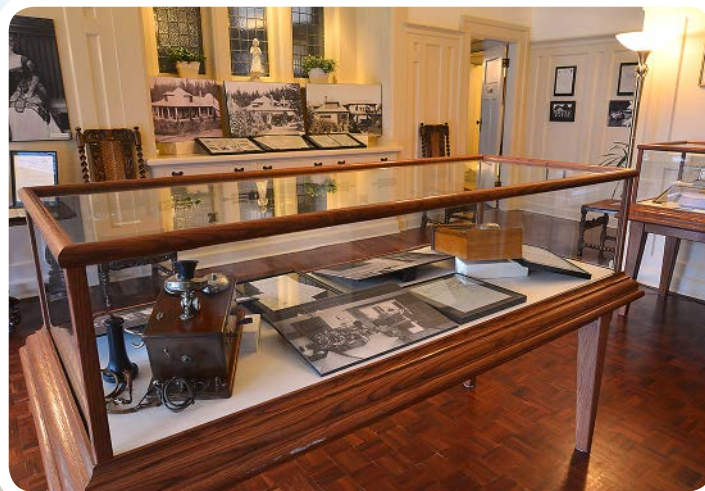
Our Historical Display, detailing the story of The Gardens through photographs, memorabilia and letters is exhibited through several rooms of the Butchart's former residence. (Closes March 15 th .)