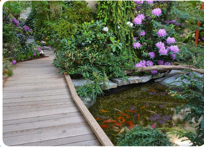
Victoria's legendary spring begins early in our Spring Prelude indoor garden with its flowers, fragrances and koi-filled ponds. (Closes March 31 st .)

*Due to limited seating, reservations are recommended. 250.652.8222